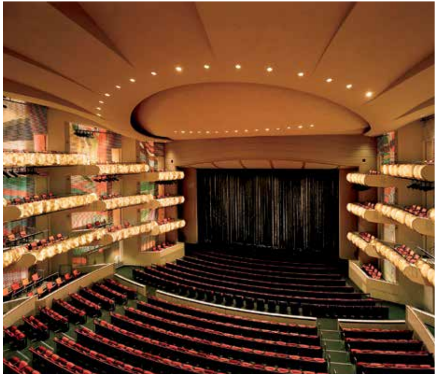
Muriel Kauffman Theatre

The stage area is 100 feet wide and 50 feet deep. A fly tower rises 74 feet above allowing scenery as tall as 35 feet to be flown above the stage. Dramatic entrances and scene changes are made possible by a flexible trap floor system in the stage floor. A wooden floor with special bounce is installed for dance performances and a large scenery dock located stage right provides access for loading in scenery and equipment from the Broadway side of the building.