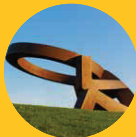
What to expect on the Public Art Tour! Check out Contemplating Child by artist Ferruccio Sardella – a 3,500-pound steel sculpture in our Public Art Tour. Using a primitive, childlike approach, the sculpture presents a gesture of a seated child in repose.

The Village of Streetsville is home to the largest concentration of historic buildings in Mississauga. The ever popular takes place at various times through the summer months—you won't want to miss the Candlelight Walk! There is no pre-registration required for the tours and it's free!