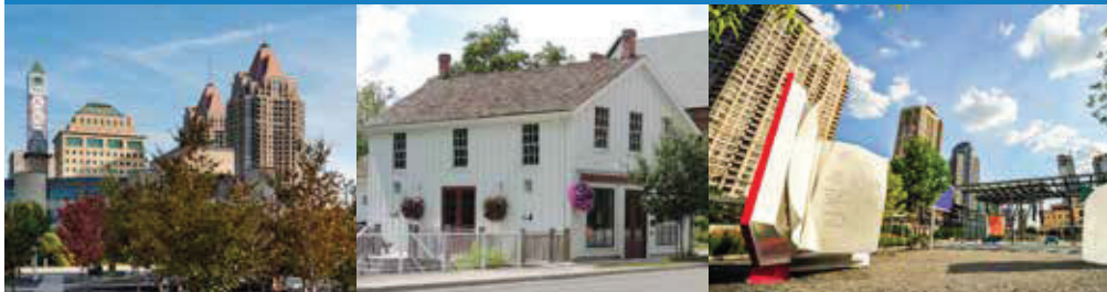
Photos, from left: Downtown Mississauga, Streetsville Historical Village, and Public Art Tour.