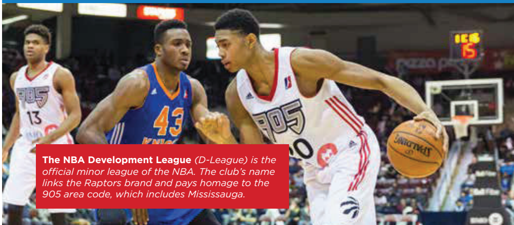
The NBA Development League (D-League) is the official minor league of the NBA. The club's name links the Raptors brand and pays homage to the 905 area code, which includes Mississauga.