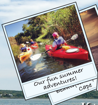
Our fun summer adventures! Cape