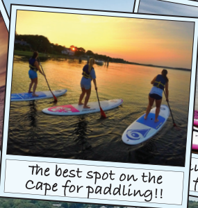
The best spot on the Cape for paddling!!