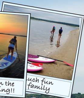
Such fun family