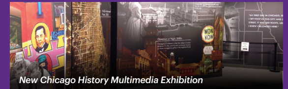
New Chicago History Multimedia Exhibition

New Multimedia Exhibition - At 360 CHICAGO, the guest experience begins at the ground floor with a museum style exhibition celebrating Chicago's history and nine of its culturally rich neighborhoods.