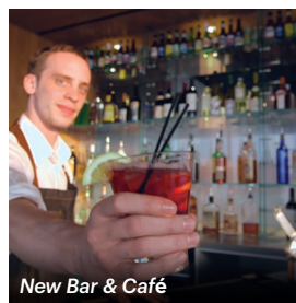
New Bar & Café