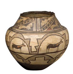
Zuni Pueblo Jar Pre-Columbian clay figure

For other special promotions, please visit brucemuseum.org.