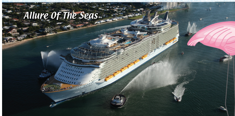
Allure of the Seas

Breathe in the sea air as you stroll freely about the upper deck, or relax in air conditioned comfort in the lower salon—without giving up the spectacular view!