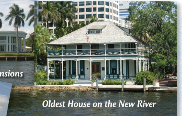
Oldest House on the New River

Our three daily departures make it simple to combine the world-class shops, cafes and nightlife of Las Olas Boulevard with a cruise on the Carrie B.