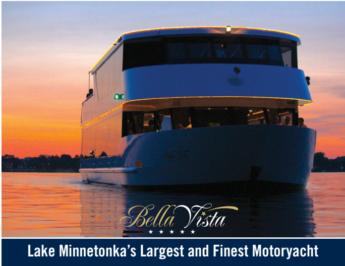
Lake Minnetonka's Largest and Finest Motoryacht