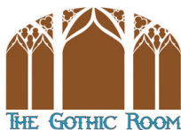
THE GOTHIC ROOM

Explore the art and craftsmanship of model ship building.