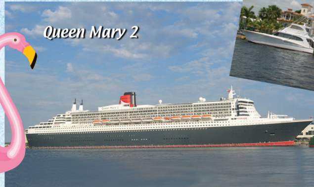
Queen Mary 2

See yachts and homes of the rich and famous along "Millionaires Row." Discover the history of Fort Lauderdale and learn all about Port Everglades, one of the world's busiest cruise ports. Marvel at gigantic cruise ships from around the world.