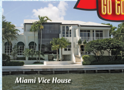
Miami Vice House