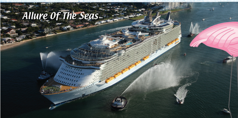
Allure Of The Seas

Breathe in the sea air as you stroll freely about the upper deck, or relax in air conditioned comfort in the lower salon—without giving up the spectacular view!