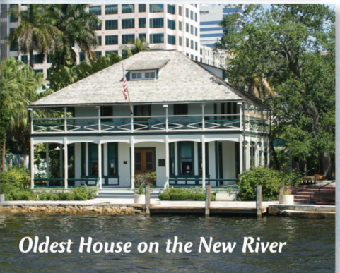
Oldest House on the New River