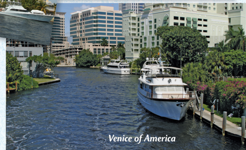
Venice of America

Buy tickets at www.CarrieBCruises.com or call (1-888-238-9805)