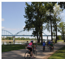
Leavenworth Landing and Trails