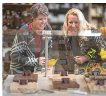
28 Block Historic Shopping District