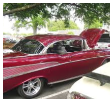
Many Events and Festivals