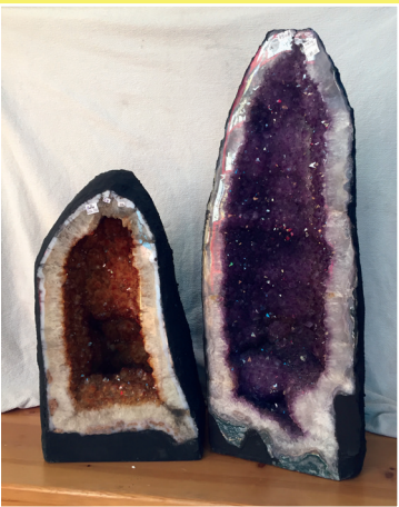
Citrine & Amethyst Cathedrals