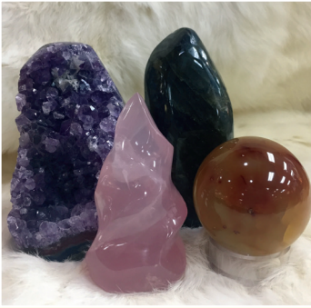
Crystals & Minerals