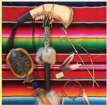
Area's Largest Selection Of Artifacts