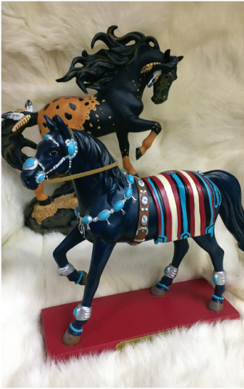
Trail of Painted Ponies collectable