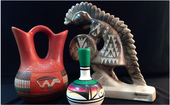
Large Selection Of Pottery From The Southwest

AMERICAN INDIAN CRAFTS & SOUTHWEST DECOR I-70, EXIT 76 IN IL St. ELMO, IL 62458