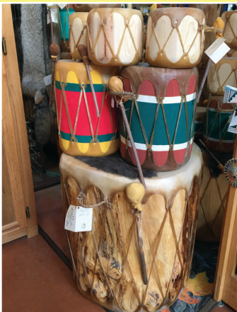
Drums from Taos New Mexico