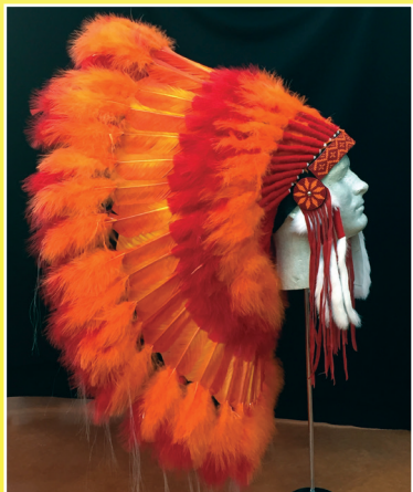
Navajo Made War Bonnet

Featuring fine quality Navajo, Santo Domingo, Zuni and Hopi Jewelry, Hopi Kachinas, Navajo and Apache Baskets, Alaskan Carved Ivory Art, Navajo and Isleta Pottery, Crow and Sioux Beadwork, and Navajo Rugs.