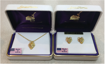
Black Hills Gold