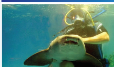
Live Shark Encounter (May 9-19)