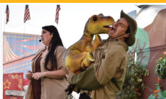
Jurassic Kingdom (May 9-19)