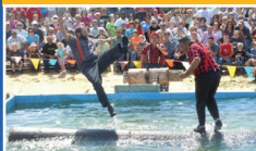
Paul Bunyan Lumberjack Show