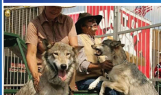
Wolves of the World (May 3-5)