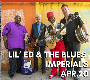
LIL' ED & THE BLUES IMPERIALS APR. 20