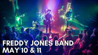
FREDDY JONES BAND MAY 10 & 11