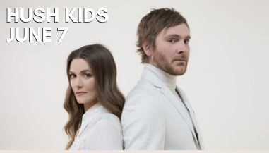
HUSH KIDS JUNE 7