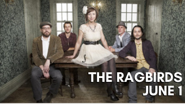
THE RAGBIRDS JUNE 1