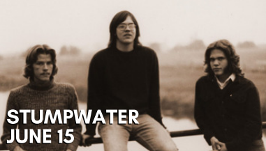
STUMPWATER JUNE 15