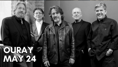
OURAY MAY 24