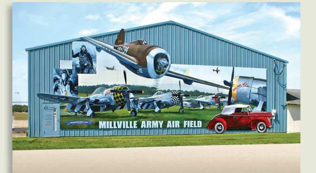
Commemorative Mural at Millville Airport

There is no other airport in the country that boasts as many original WWII buildings as Millville — America's First Defense Airport. Of approximately 100 buildings in use during WWII, from 1941 through 1945, twenty-five (including two hangars) and a site known as the "parade grounds" were named to the New Jersey Historic Register in May 2010. We are very proud of this designation and that these buildings remaining from the Millville Army Air Field will continue to be testament to the important history that took place here at Millville Airport during WWII.