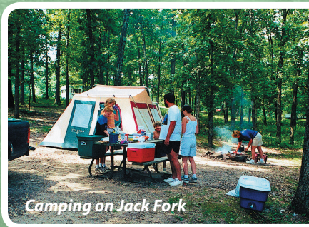
Camping on Jack Fork

Canoe Trips One Day, Two Day, Three Day, & Longer.