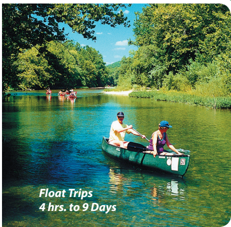
Float Trips 4 hrs. to 9 Days