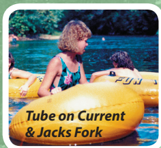
Tube on Current & Jacks Fork

Canoe Trips One Day, Two Day, Three Day, & Longer.