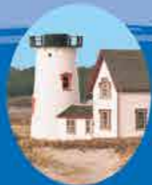
Stage Harbor Light

Several great white sharks have been tagged off Monomoy.