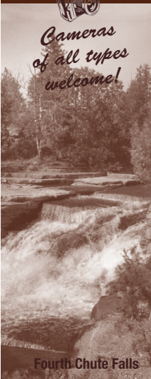
Fourth Chute Falls