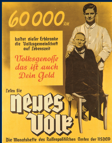
“60,000 reichsmarks is what this hereditarily ill person will cost the national community over the course of his life. Citizens, this is also your money!” Nazi propaganda flyer to build public support for a mass sterilization program, circa 1937. Deutsches Historisches Museum, Berlin

Opposite side: Anthropological calipers. Deutsches Historisches Museum, Berlin