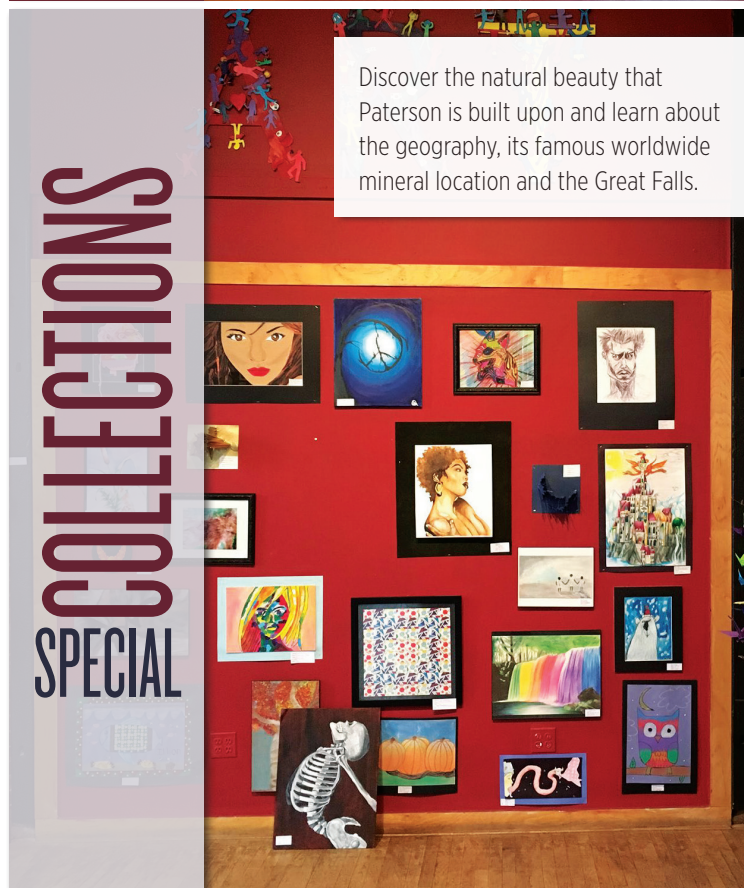
Discover the natural beauty that Paterson is built upon and learn about the geography, its famous worldwide mineral location and the Great Falls.