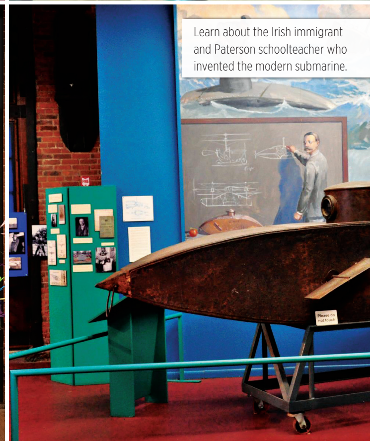
Learn about the Irish immigrant and Paterson schoolteacher who invented the modern submarine.