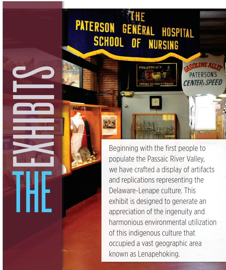
Beginning with the first people to populate the Passaic River Valley, we have crafted a display of artifacts and replications representing the Delaware-Lenape culture. This exhibit is designed to generate an appreciation of the ingenuity and harmonious environmental utilization of this indigenous culture that occupied a vast geographic area known as Lenapehoking.

The S.U.M. fulfilled the vision of its founder for more than 150 years, moving the United States from an agrarian, slaved-based economy to one based in industry and freedom. Paterson attracted successive waves of immigrant entrepreneurs, skilled craftsmen, and workers, the "diversity of talents" Hamilton had hoped would be drawn to America. Immigrants still settle here to pursue their "American Dream" and to weave their threads into the storied fabric of Silk City.