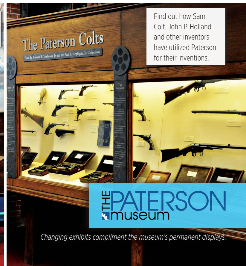
Find out how Sam Colt, John P. Holland and other inventors have utilized Paterson for their inventions.