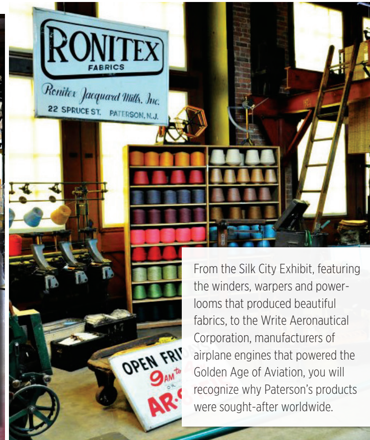
From the Silk City Exhibit, featuring the winders, warpers and power-looms that produced beautiful fabrics, to the Write Aeronautical Corporation, manufacturers of airplane engines that powered the Golden Age of Aviation, you will recognize why Paterson's products were sought-after worldwide.