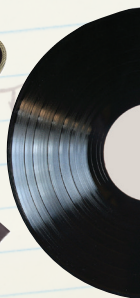
EXHIBIT ON DISPLAY OCT. 12, 2019 - FEB. 2, 2020