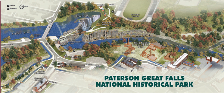
PATERSON GREAT FALLS NATIONAL HISTORICAL PARK