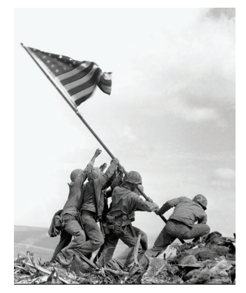
Joe Rosenthal/The Associated Press, 1945 Pulitzer Prize

With the click of a button, photographers record the defining moments of our world and our time. The ugliness of war. The pain of poverty. The ecstasy of victory. The triumph of redemption. Pulitzer Prize Photographs features the most comprehensive collection of Pulitzer Prize-winning photographs ever assembled. From iconic images like Joe