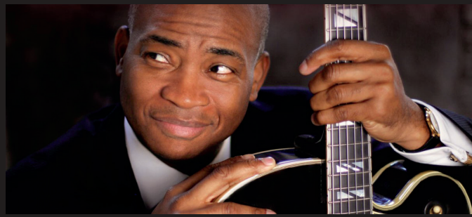
February 27 - March 1 (Thu - Sun) RUSSELL MALONE QUARTET