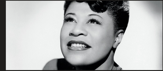
April 16 - 19 (Thu - Sun) ELLA FITZGERLAD CELEBRATION FEAT. BRIANNA THOMAS