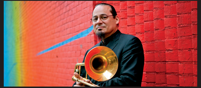
April 16 - 19 (Thu - Sun) STEVE TURRE QUINTET