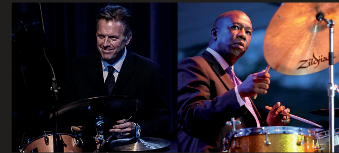
February 20 - 23 (Thu - Sun) THE NEW DRUM BATTLE: Kenny Washington vs. Joe Farnsworth