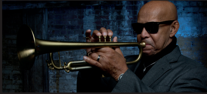
February 6 - 9 (Thu - Sun) EDDIE HENDERSON QUINTET