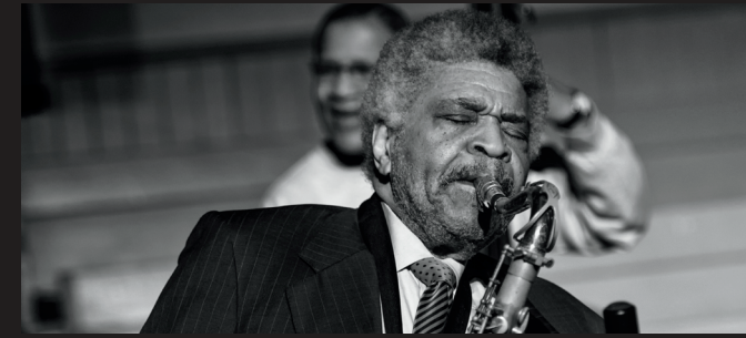
March 12 - 15 (Thu - Sun) GEORGE COLEMAN QUARTET "Birthday Celebration"