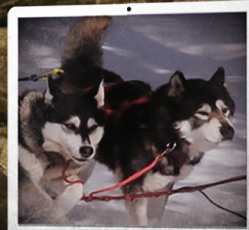
SLED DOG DEMOS