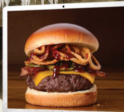
GREAT PLACES TO EAT