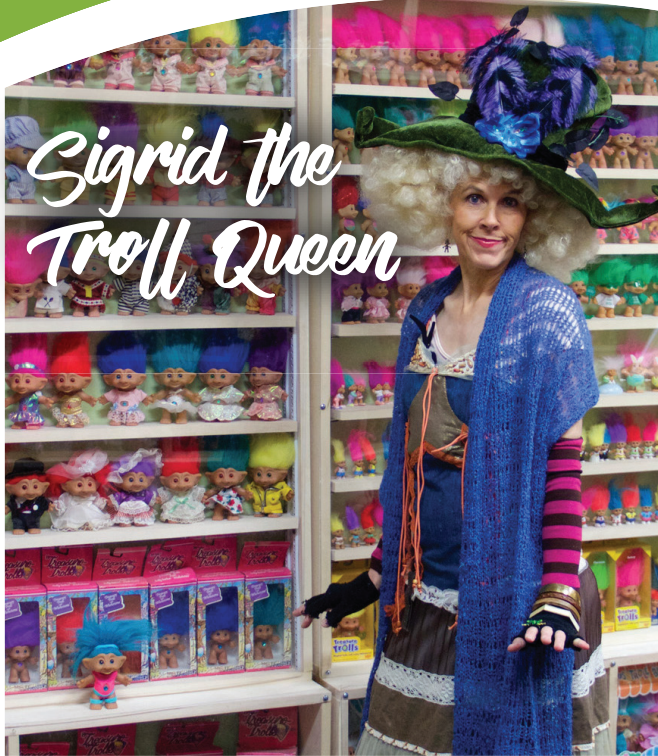
Sigrid the Troll Queen