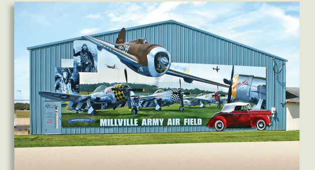
Commemorative Mural at Millville Airport

There is no other airport in the country that boasts as many original WWII buildings as Millville — America's First Defense Airport. Of approximately 100 buildings in use during WWII, from 1941 through 1945, twenty-five (including two hangars) and a site known as the "parade grounds" were named to the New Jersey Historic Register in May 2010. We are very proud of this designation and that these buildings remaining from the Millville Army Air Field will continue to be testament to the important history that took place here at Millville Airport during WWII.